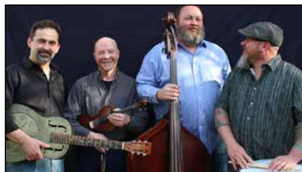
SAT, MAY 13, 2023 @ 2:00 PM Mt. Morris Town Park