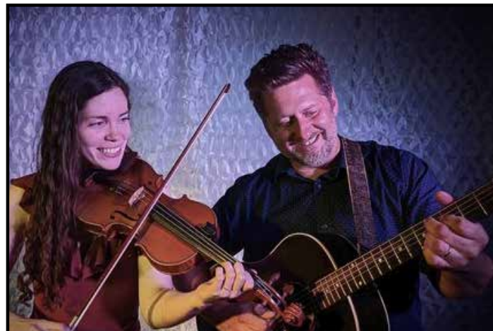
SATURDAY, AUG. 10 - 2:00 PM Weary Ramblers

"At this stage of the game," said the singer from his home outside of Chicago, Illinois, "I feel like I'm doing my best work."